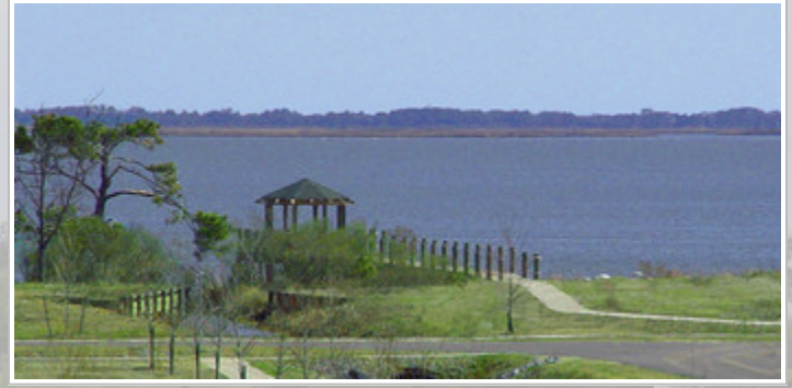
View of pier and gazebo from the master BR