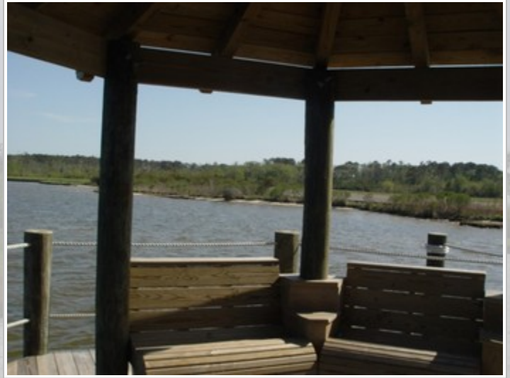
Another view from inside the gazebo, looki...