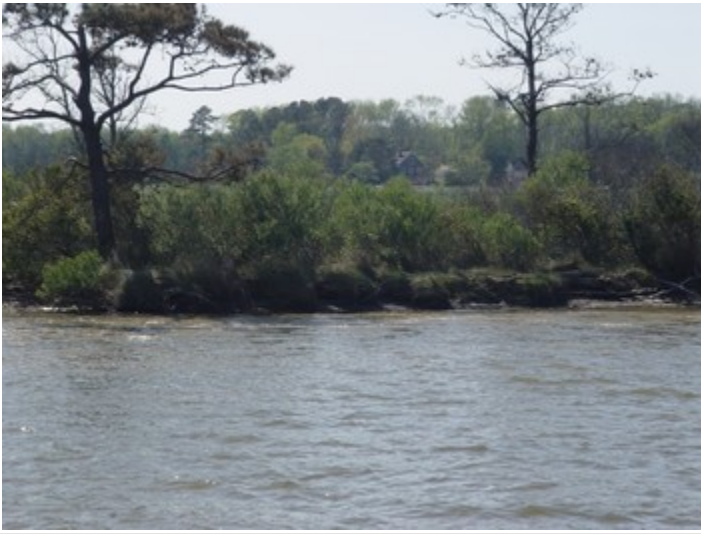
View of Currituck Crossing's shoreline fro...