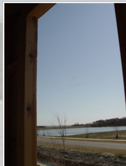
View from the southern (side) wall of the ...