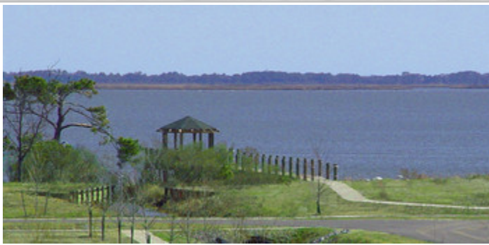
View of pier and gazebo from the master BR