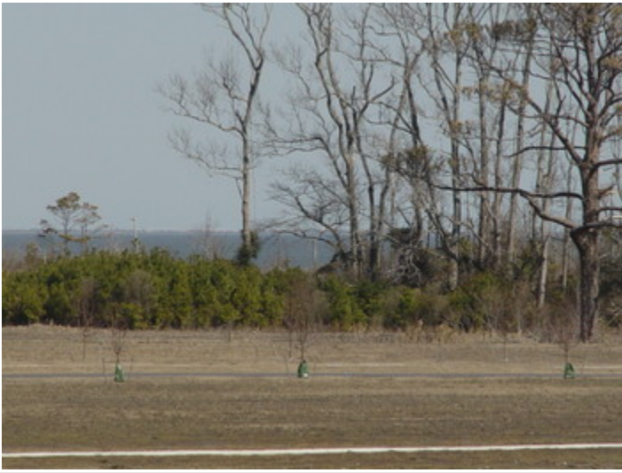
Looking northeast from the kitchen

ROB LADD | (252) 457-1129 | RLADD@TWIDDY.COM