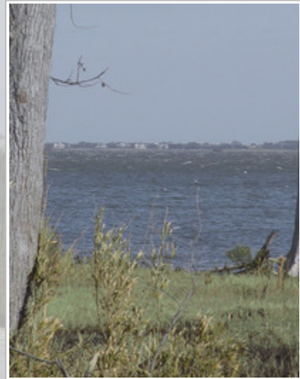
View across the Sound