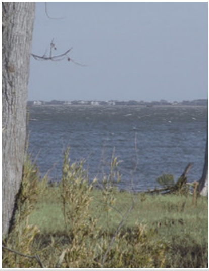
View across the Sound