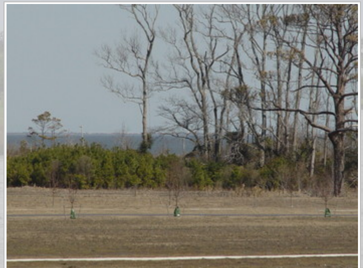
Looking northeast from the kitchen