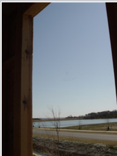
View from the southern (side) wall of the ...